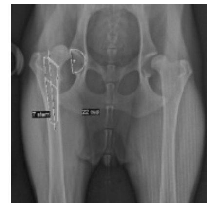
Prior to surgery, the patient is templated to ensure that appropriately-sized acetabular cup and femoral stem are implanted.