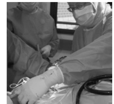
The femur is broached and prepared for the introduction of the femoral stem, which forms the pivoting surface of patient's new hip.