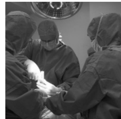
The acetabulum is prepared by broaching, or drilling-out, the cavity where the acetabular cup will be placed.