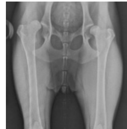
The patient, a Labrador Retriever, presented to PVSEC Surgery with a history of bilateral lameness. Physical examination of the left hip, and preoperative radiographs confirmed severe hip luxation.