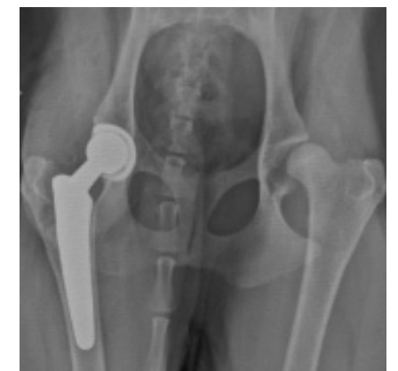
During surgery, radiographs allow visual confirmation of the optimal placement of the new hip.